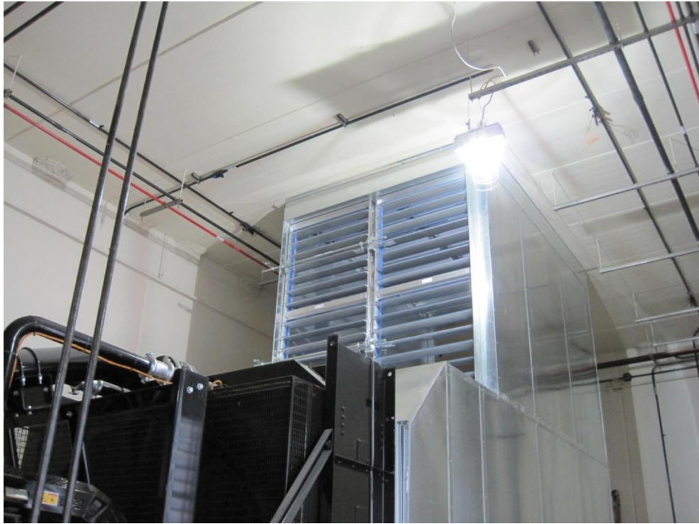
Duct Bank Between Electrical and Generator Building