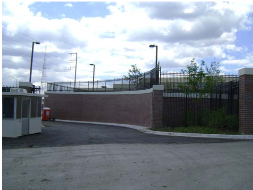
Lower Parking Lot Entrance