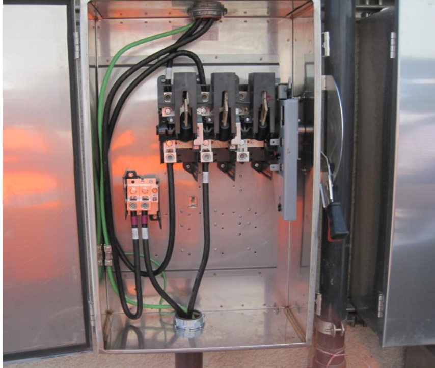
Cable Termination in CT Meter Cabinet