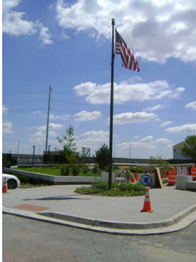
Front Entrance Progress