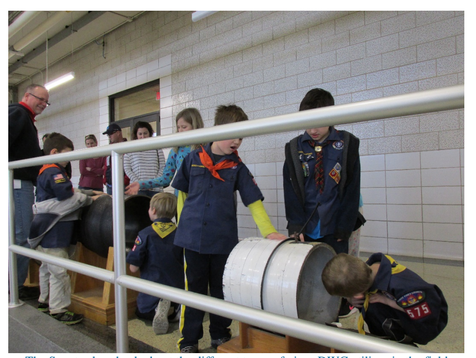
The Scouts also checked out the different types of pipes DWC utilizes in the field