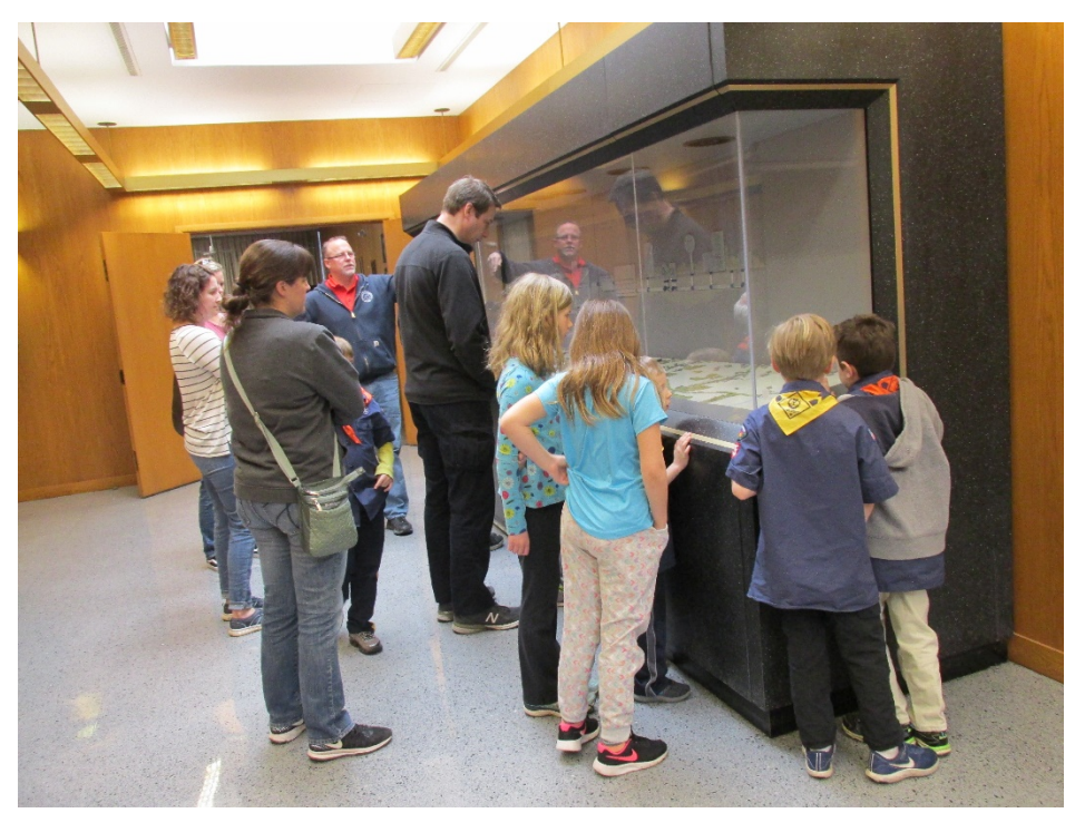
Scouts viewing the Commission's display on how water travels through DWC's system