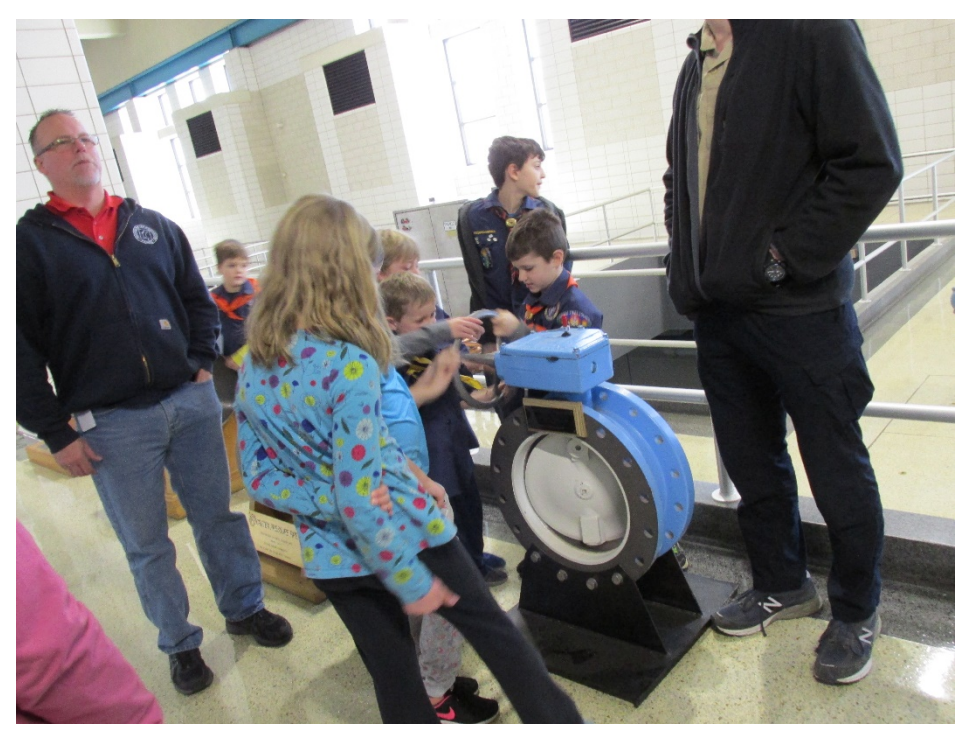
They tried their hand at turning a butterfly valve