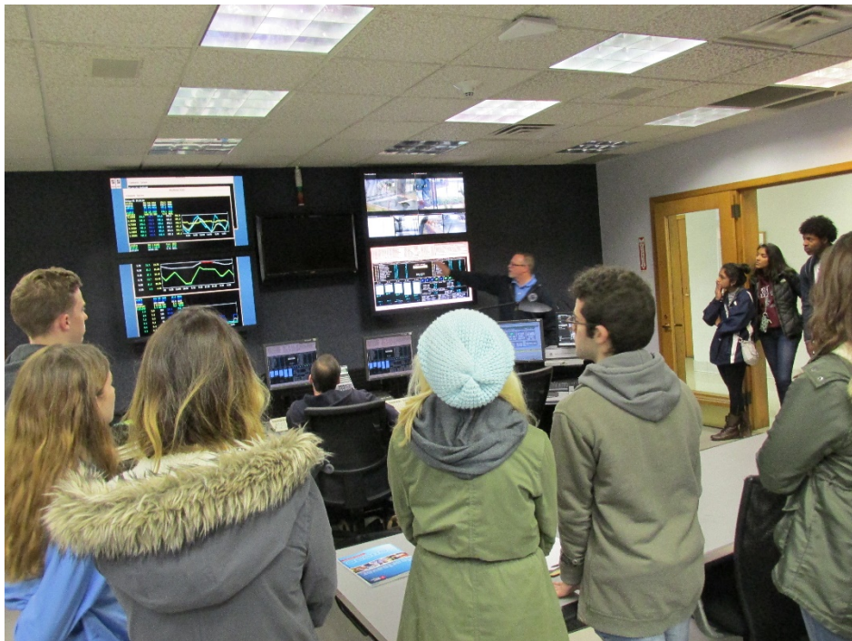
Students viewing the Commission's control room