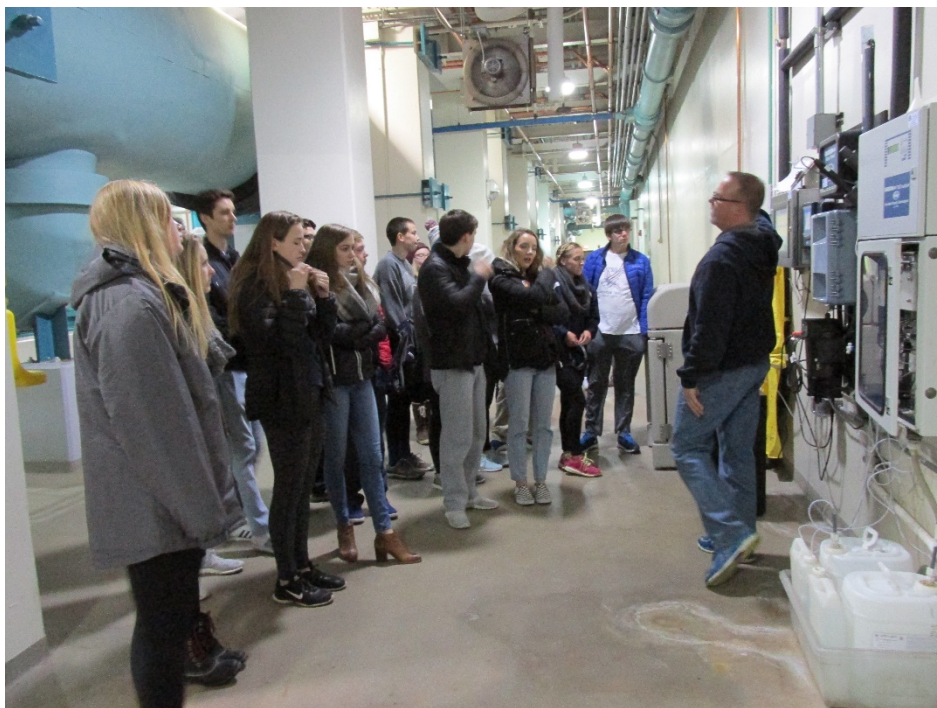
Mr. Weed describing DWC's early monitoring detection system