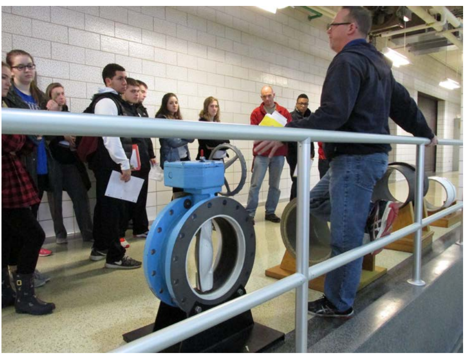
Weed pointing out the different types of pipes DWC utilizes in the field