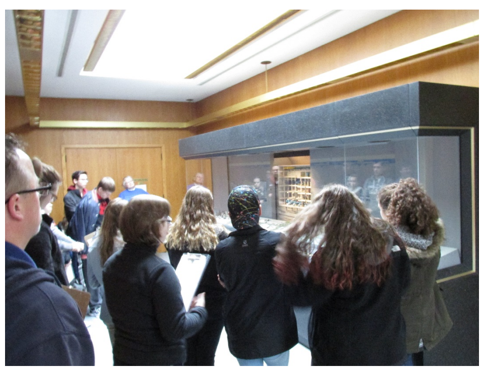
Students viewing the Commission's display on how water gets delivered to DWC's customers