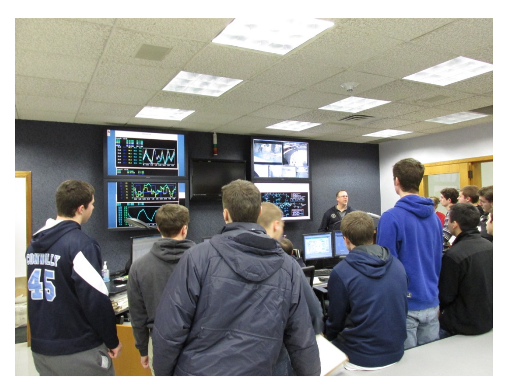
Weed showing the students DWC's SCADA system in the control room