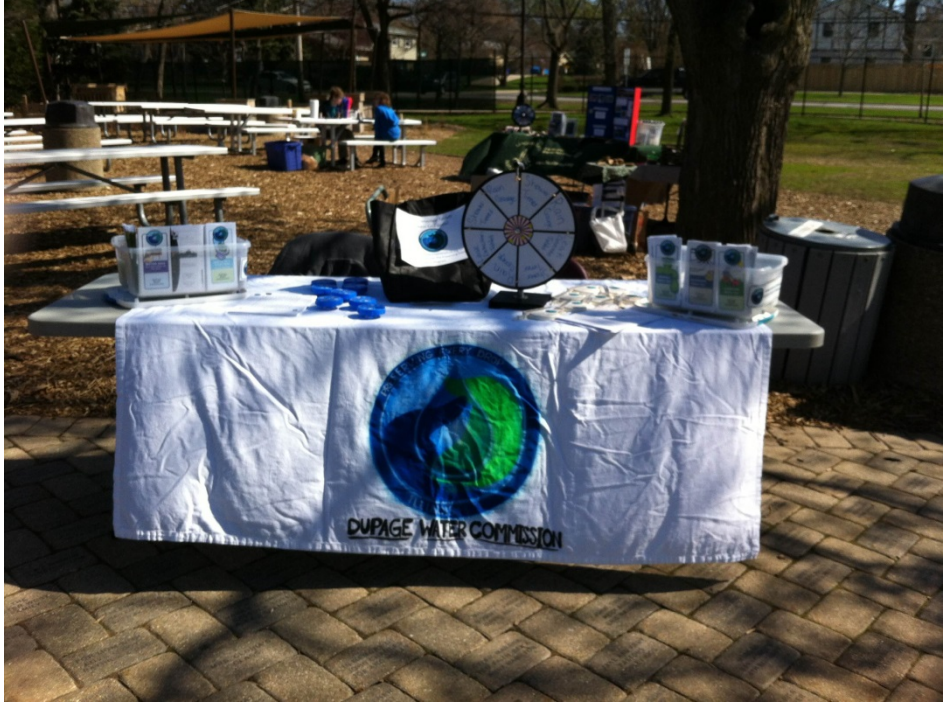
Preserving Every Drop Giveaway table