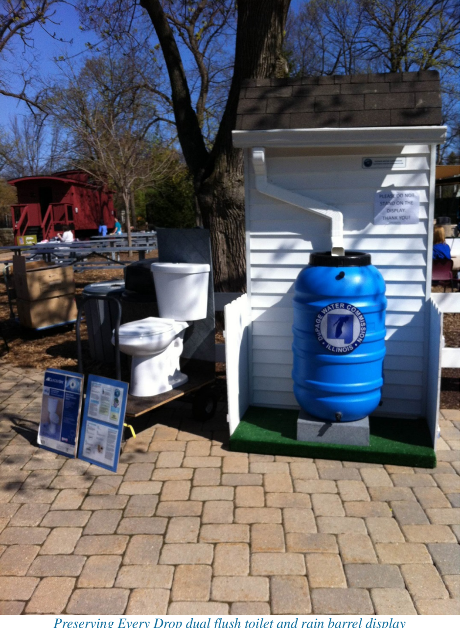
Preserving Every Drop dual flush toilet and rain barrel display