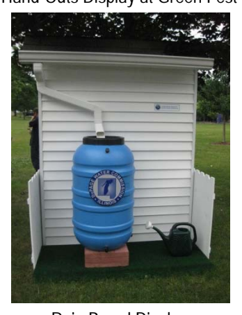
Rain Barrel Display