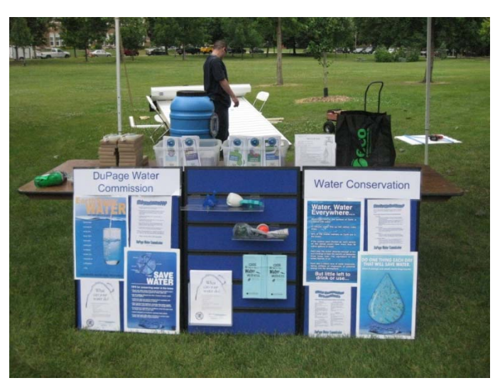
Hand-Outs Display at Green Fest

Despite some rain, around 400 people passed by our booth. The rain gauges that were dispersed were gone within the first two hours.